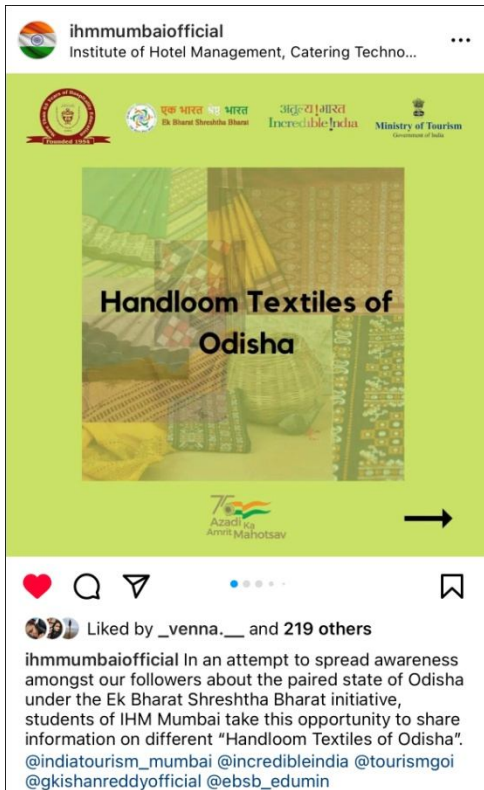
Instagram Post Image 1