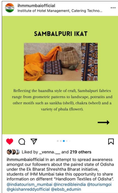
Instagram Post Image 3